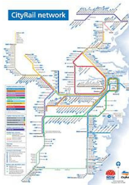
Sydney Rail Network map