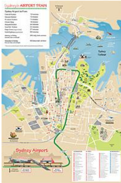
Sydney City Map